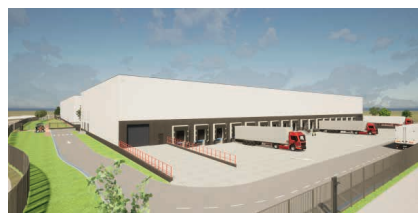
Invest in modern TSPs