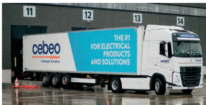
Company-owned truck fleet