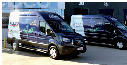
Electric delivery vans