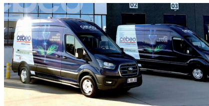
Electric delivery vans