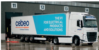
Company-owned truck fleet