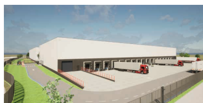
Invest in modern TSPs