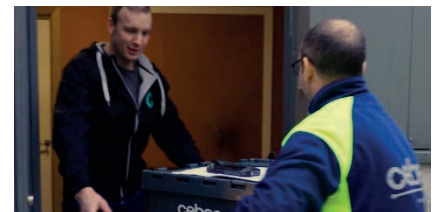
Personal contact with dedicated drivers